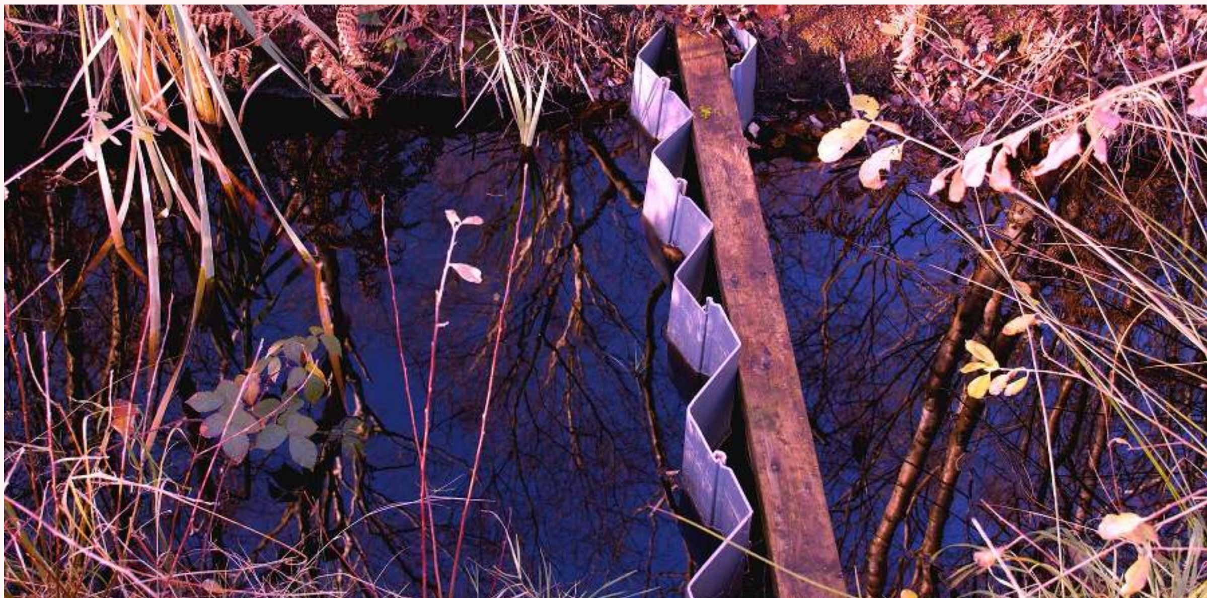
IMAGE (TOP): Chökyi Nyima Rinpoche attends to the finer aspects of the shrine offering IMAGE (BOTTOM): Keeping water 'uphill' on the Lindholme Old Moor, Still from the film Full Circle (2022)

To protect, preserve and nurture the rare habitat of the Lindholme estate, support the regeneration of the wider peatlands and proactively contribute to alleviate our present-day environmental challenges.