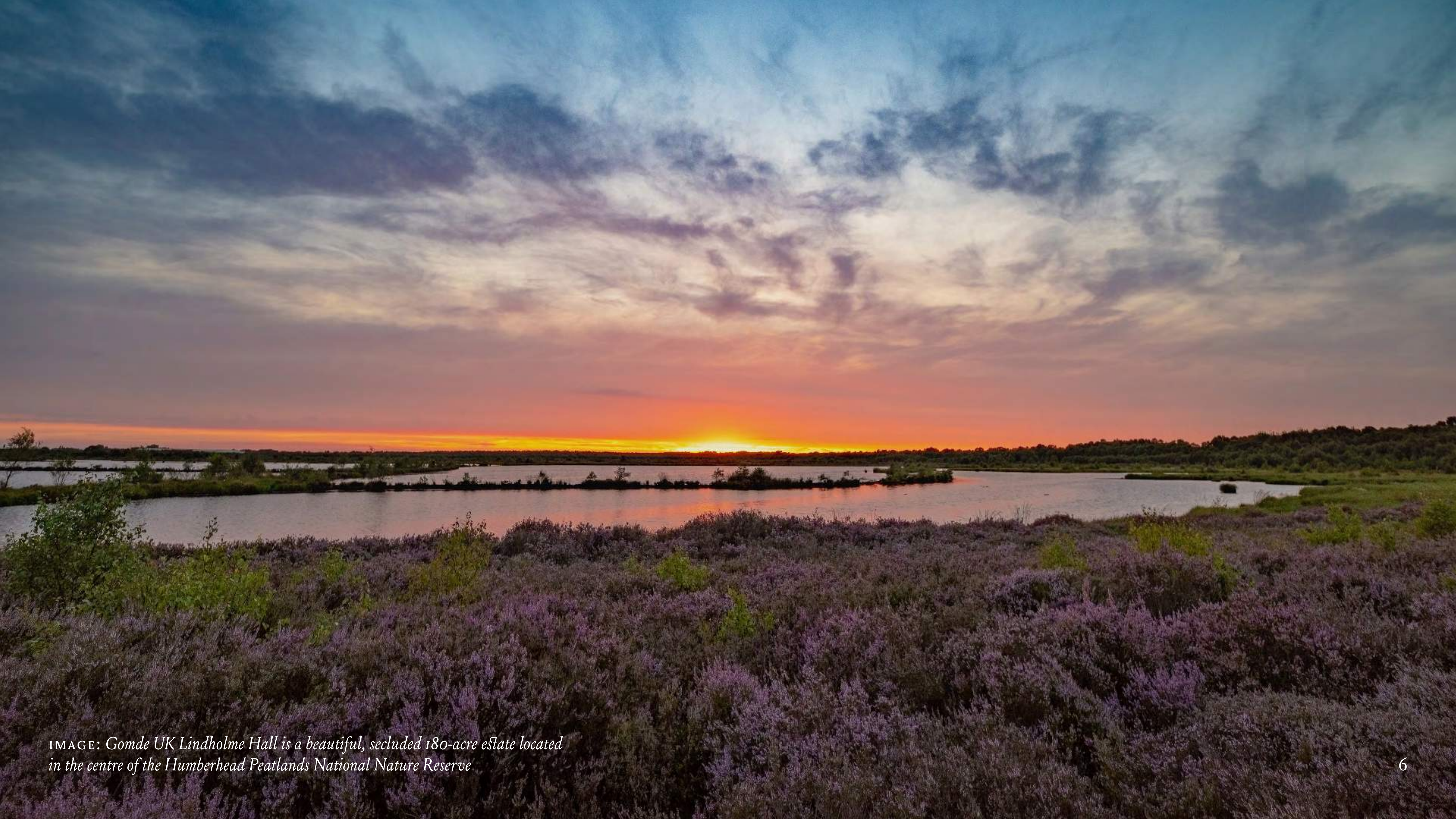
IMAGE: Gomde UK Lindholme Hall is a beautiful, secluded 180-acre estate located in the centre of the Humberhead Peatlands National Nature Reserve