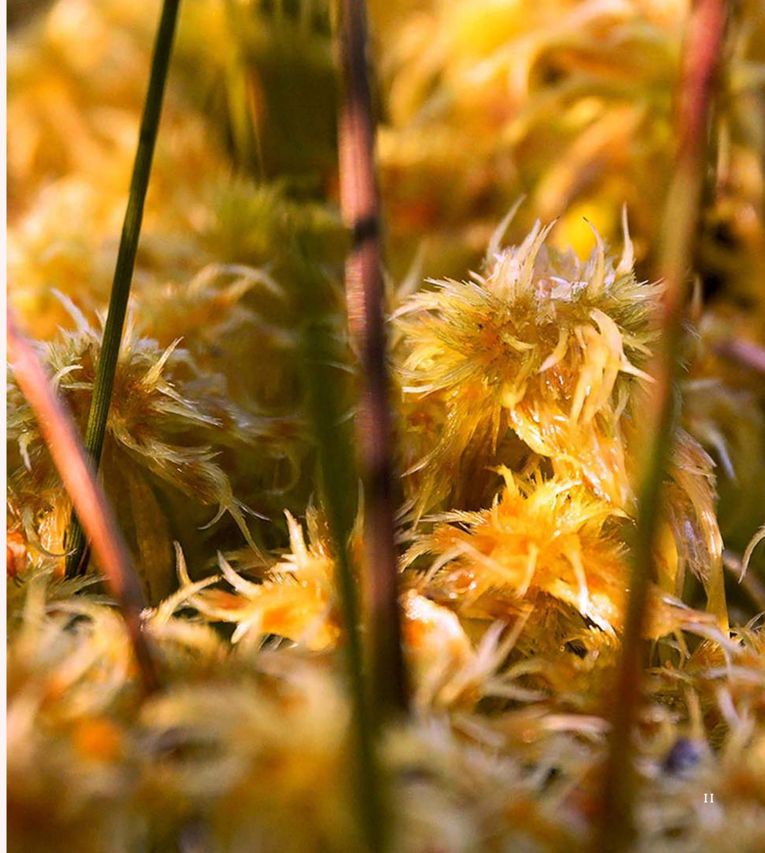
IMAGE: Sphagnum moss—the building block of peatland regeneration, Still from the film Full Circle (2022)

The new Peatland Retreat Wing represents an extraordinary opportunity to meet both of these objectives. Not only will its creation further establish Gomde UK as a base for authentic Buddhist practice in the UK, we will also ensure it will positively impact upon the rare habitat of the Lindholme estate, the surrounding National Nature Reserve and be part of a global response to counteract the impacts of climate change.