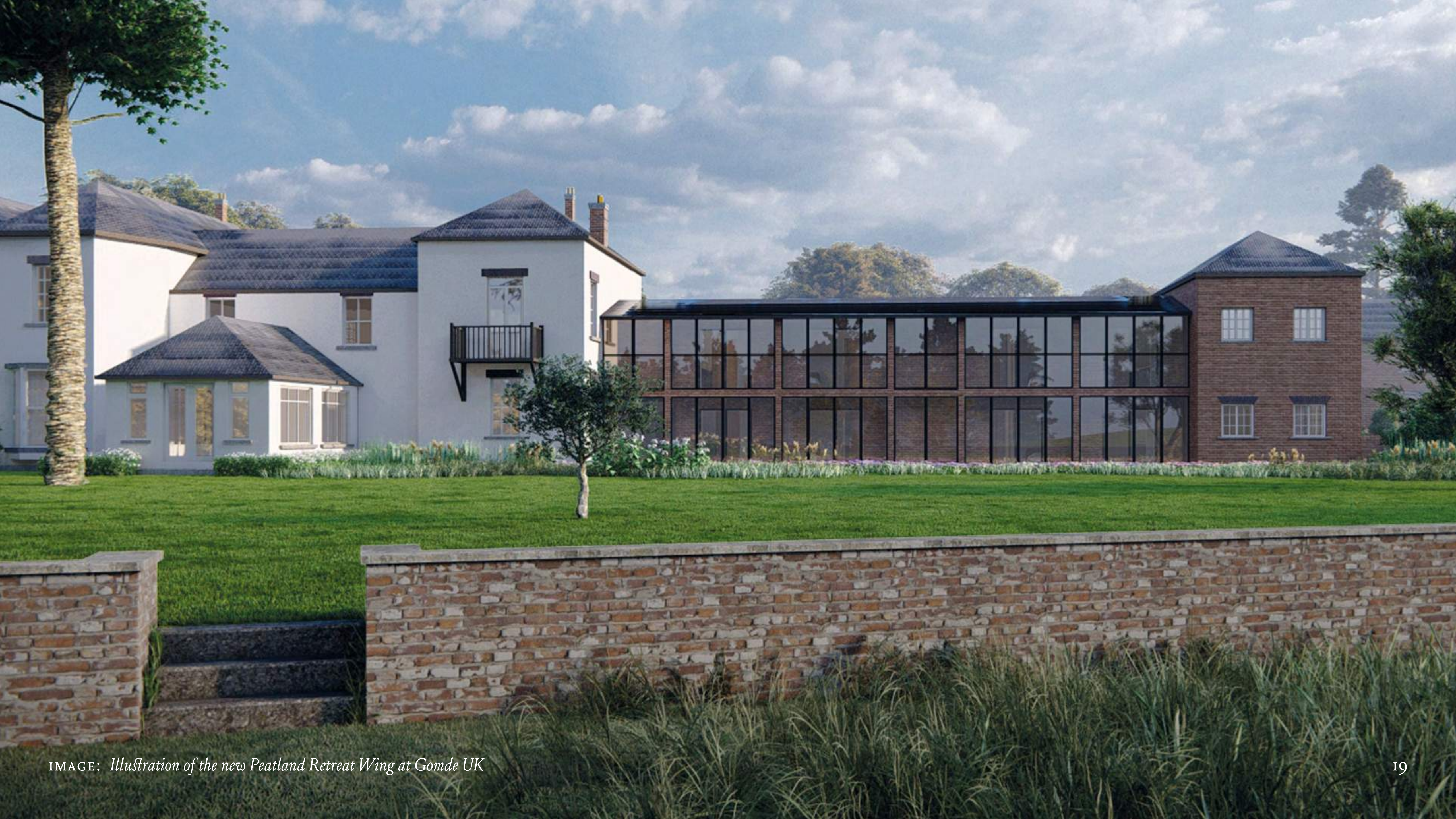
IMAGE: Illustration of the new Peatland Retreat Wing at Gomde UK